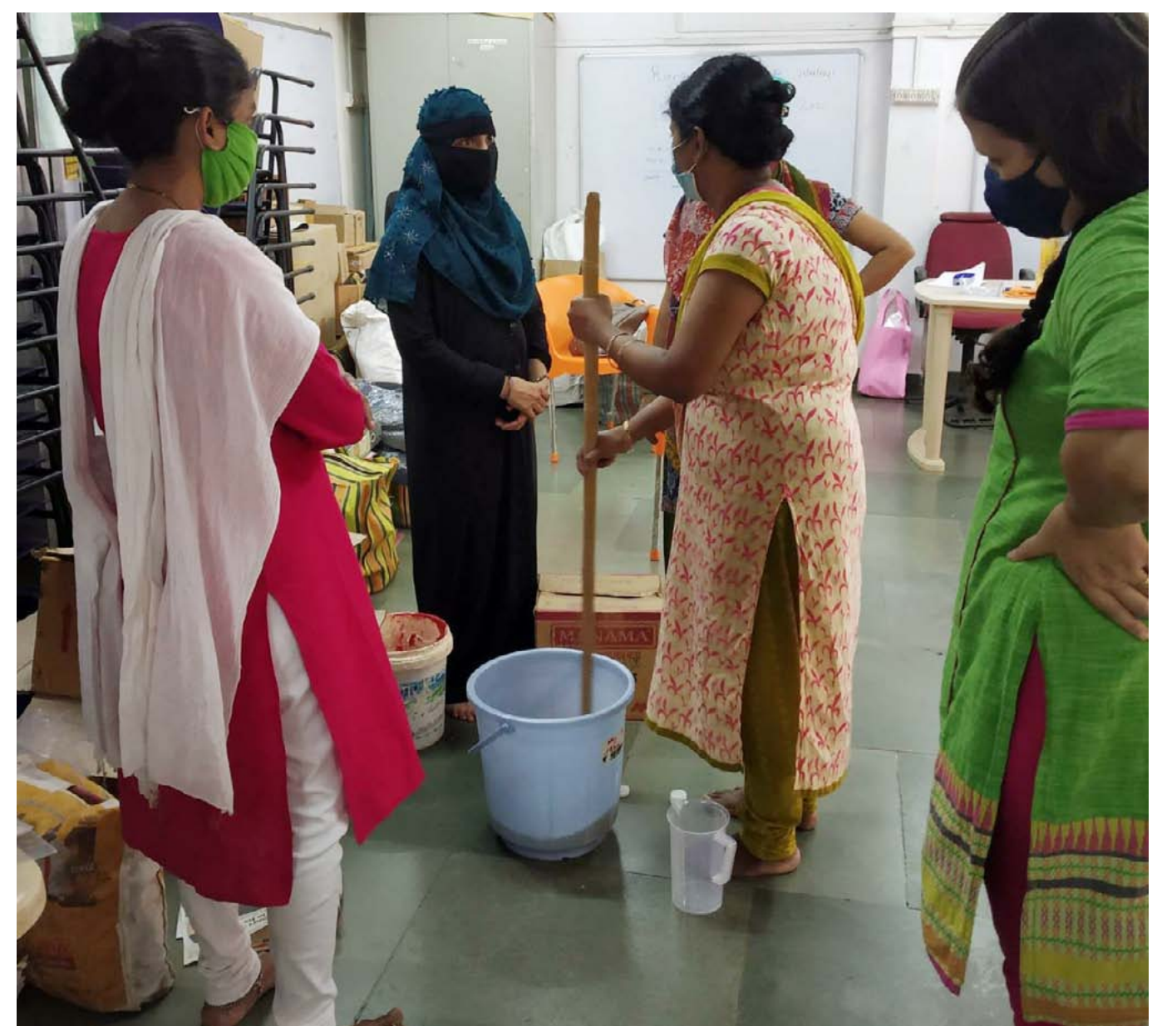
Entrepreneurship training for cleaning materials.

This was a new initiative for RF(I)T. The pandemic brought into sharp focus the dismal state of sanitation and hygiene in community toilets. At times, COVID-19 positive patients were also using the same facilities as others because there were no options. RF(I)T started processes to make people aware of the impact of these conditions on health. Groups of women showed interest in monitoring this.